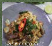
SPICY FRIED RICE

Fried rice with chilli and Thai basil onion, egg & Chinese broccoli in oyster sauce