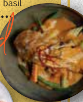
SALMON BLACK PEPPER