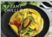
CREAMY CHILLI BASIL

Garlic and grounded pepper with mixed vegetable