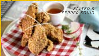
SALTED & PEPPER SQUID

Golden pastry bag stuffed with mince chicken, corn, crushed peanut served with plum sauce