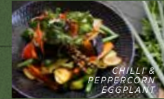
CHILLI & PEPPERCORN EGGPLANT